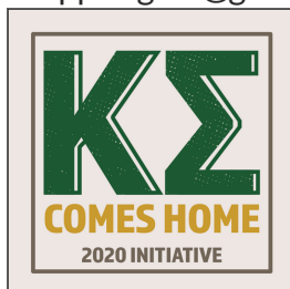
The logo for Kappa Sigma Comes Home.

Gamma-Chi is currently sitting in limbo in terms of housing but is looking for a house to accommodate up to 20 live-in brothers and give the chapter a new home and meeting place. Those interested in helping or discussing the housing project, please email the chapter at kstatekappasigma@gmail.com .